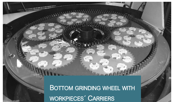
BOTTOM GRINDING WHEEL WITH WORKPIECES' CARRIERS

Our grinding wheels can be used in machines from all major manufacturers, e.g. Melchiorre, Peter Wolters, Stähli, Supfina and other.