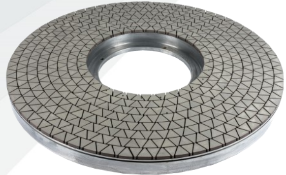
WHEEL Ø710 MM, VITRIFIED BOND, TRIANGULAR PELLETS